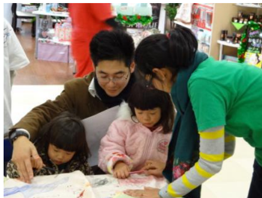
Many children with their fathers, families -a sight we haven't seen before.

We learned many things during the Exhibition at Mast last December. Many of the people who came to shop have young children. Lots of those children were born after the tsunami. Very few people used baby carriages. Infants who cannot walk were carried, but even toddlers walked at their own pace with the parents following next to them or behind them. Sometimes they hold hands, but if the child stops, so does the parent. If they run, the parents run, too. Instead of rushing their children, the parents match their pace. At our exhibition space, the same thing occurred. Parents remained there until the children were ready to leave. We could feel the harmony of the family circle as the parents sat watching their children draw happily. When we asked if they talked about the tsunami with their children who are too young to remember or were born after, many replied "We will have to tell them, but we still don't know how or when."