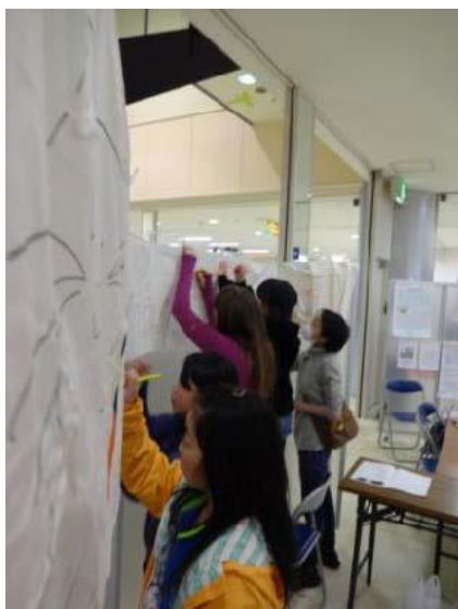
We left a 'temporary wall' in Otsuchi. A big panel and cloth. Now you can draw whenever you want!

One grandmother told us, "No one said that the tsunami would come to my place so I wasn't worried, but actually I barely escaped with my life. Her family was all right, too, but everything was lost. But old people are OK, it is the young people who have it rough. Staying in the temporary housing with nothing to do is depressing, so I come here. (Looks at exhibit). I am happy to see this bright space. I am grateful for everyone's help. When the disaster happened, I panicked and couldn't do anything. I couldn't even cry. And then I just cried and cried. Now I can't even shed tears." When we said, "Next time we meet, let's hope they are tears of joy," she began to cry.