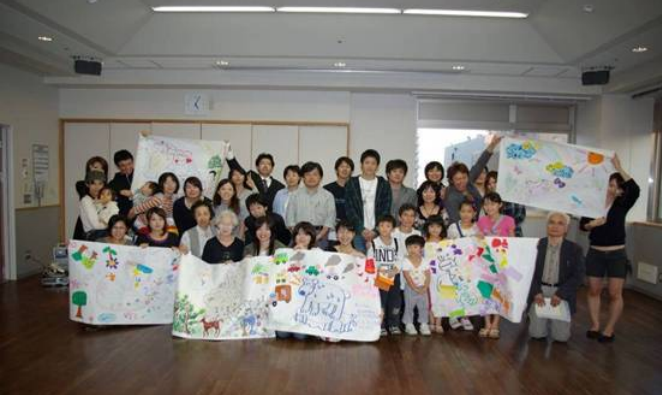
Popoki in Niigata!