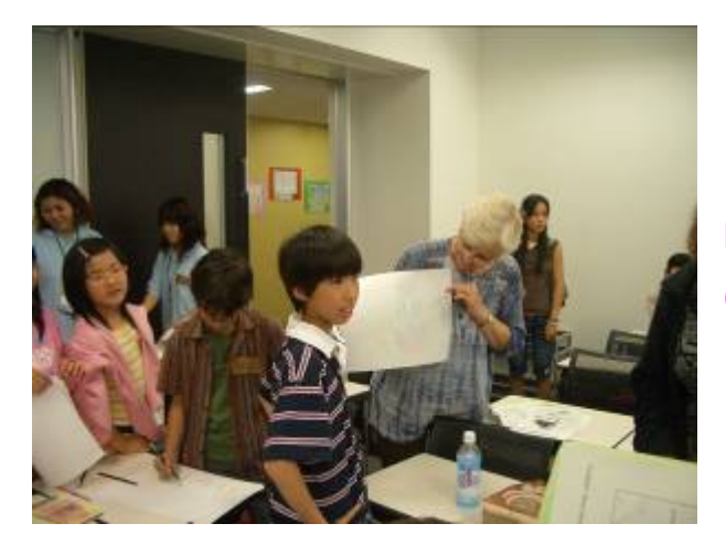
Peace as a Global Language (Imagine Peace) 10.28