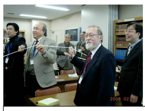
Do you think Japan is at peace now? These are the people who positioned themselves near "Yes."

On 19 February, I joined a faculty development workshop for about 40 faculty members at St. Thomas University in Hyogo Prefecture. Spending time with Popoki in a warm and relaxed atmosphere was nothing new for me, but this workshop held a big surprise. We spent the first part thinking about