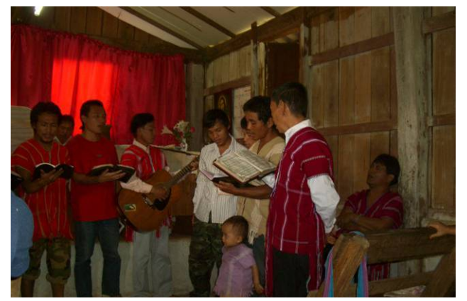
At the church in the village of Karen tribe

In the history of Christianity there are, in fact, times that it chased away 'other colors,' and enlarged itself all over the world, even though 'Christianity' is only a single 'one of the colors.' Unfortunately there was not time or a chance for me to share about that kind of issue with the children. But I pray that I will be able to lead to such a