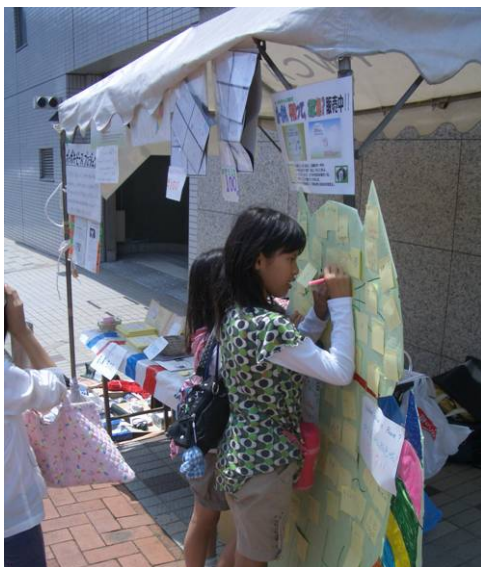
Participants wrote their 'peace colors' and posted them on BIG POPOKI

At this festival, the main purpose of Popoki Peace Project was to sell Popoki's Peace Book 2 which was published last month. Fortunately, however, Project members also engaged in an interactive activity, asking local people the color of peace. Therefore there were a lot of peace colors around the Popoki Peace Project booth and thus I think that BIG-POPOKI was also satisfied with it. In addition, Project members could talk to local people about a lot of things and had a rare chance to learn about their experiences not only in the earthquake but also in the war.