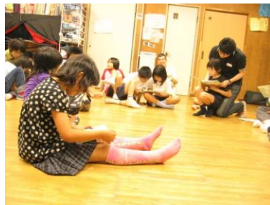
Photo: Children reading