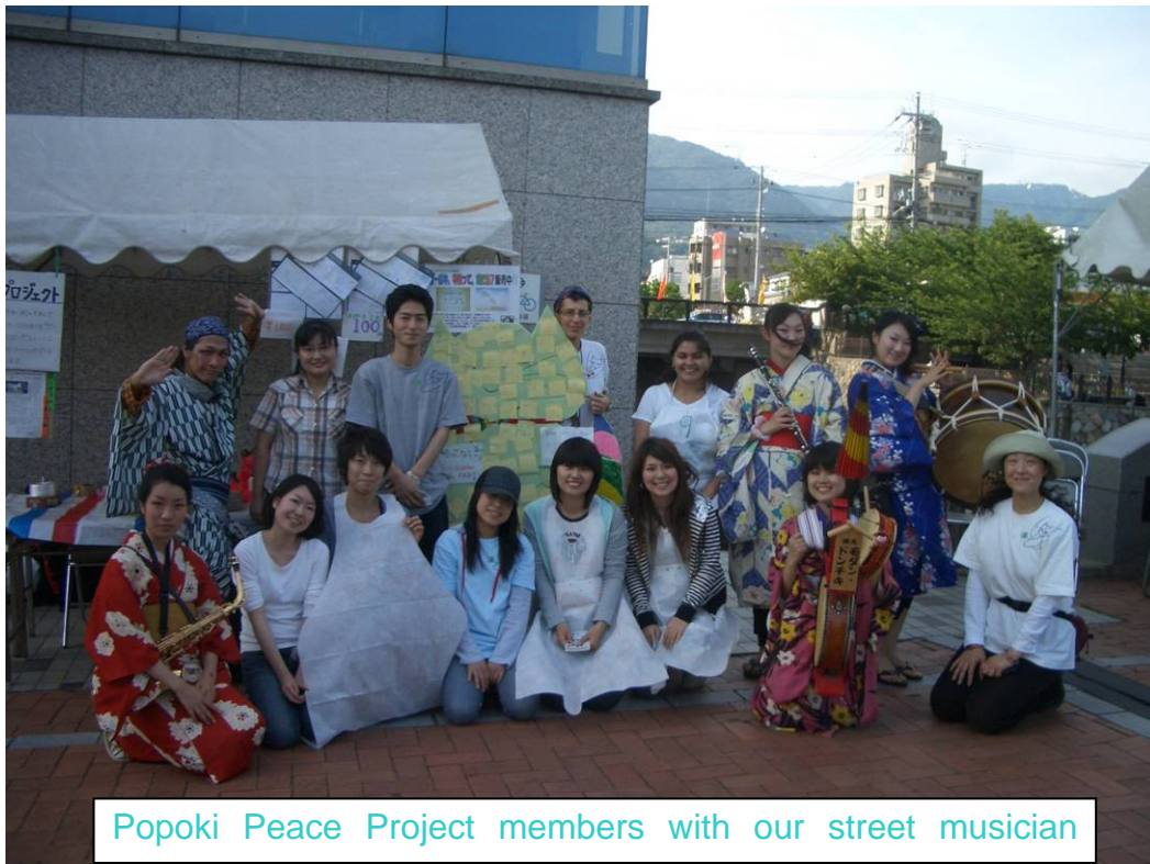
Popoki Peace Project members with our street musician

BIG POPOKI has taken up residence at Kobe University