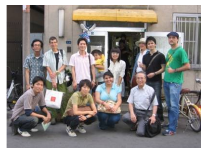
Photo: At the entrance of KODOMO no SATO