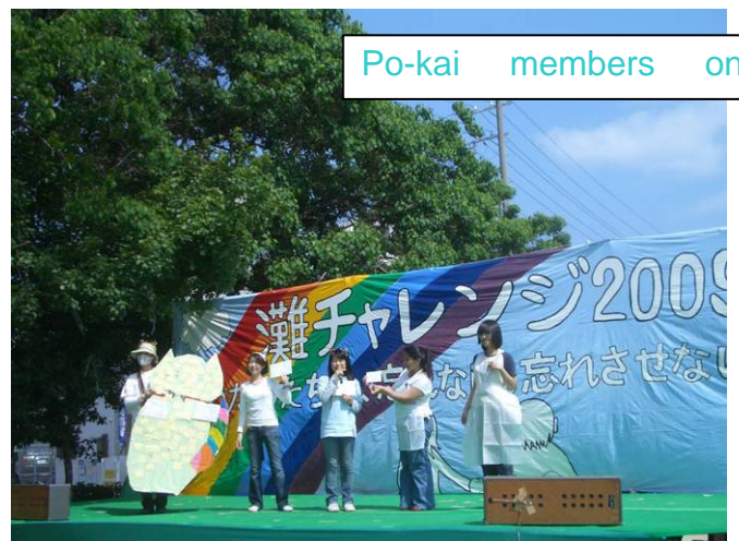
Po-kai members on

Participating in Nada Challenge made me reconsider the meaning war and the threat of earthquakes, and the meaning of peace. Moreover, I realized that it was important to pass on memories to the next generation through this festival. Even though we could not sell very many books, "Nada Challenge 2009" gave us a good opportunity to learn many things, so I think that it succeeded overall. Finally, I would like to say thank you to everyone for their kindness and cooperation.