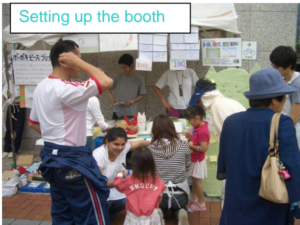
Setting up the booth

On June 07th, the Popoki Peace Project's members took part in the 15 th annual "Nada Challenge 2009" which was held in Togagawa Park. "Nada challenge" is a festival which has been organized by students and volunteers since 1995. It was begun in order to encourage people after the Great Hanshin-Awaji