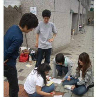
We made a BIG POPOKI!

never forget, nor allow the past to be forgotten." There were many booths and events, and the Popoki Peace Project members enjoyed themselves, especially with the neighboring booths: Japanese Chindonya (street musicians) and a junior high school juggling club. Thanks to everyone's cooperation, I think that the festival was very heartwarming and a big success.