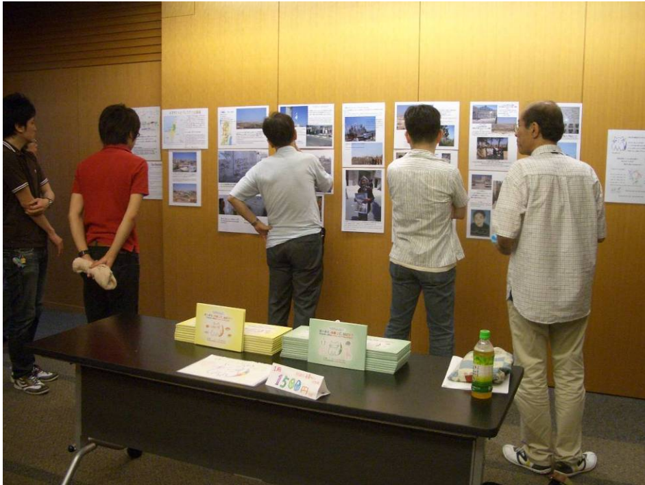
Photo: Viewing photos from 'Popoki in Palestine 2008'