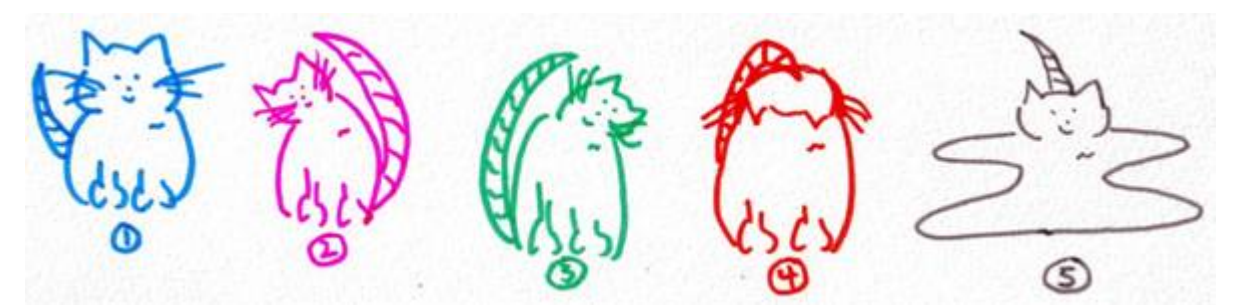
Congratulations! You have successfully completed Lesson 16. Remember to practice every day for at least 3 minutes. See you next month for lesson 17!