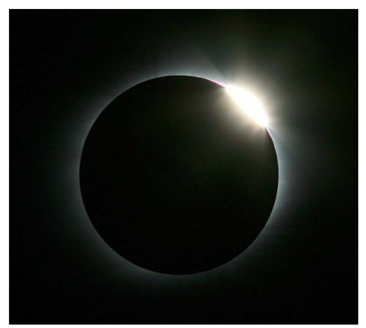
http://popoki.cruisejapan.com/index_e.html popokipeace (at) gmail (dot) com