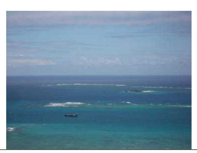
Photo: Looking off the southern coast of Okinawa Island (Ronni, 2009.9)