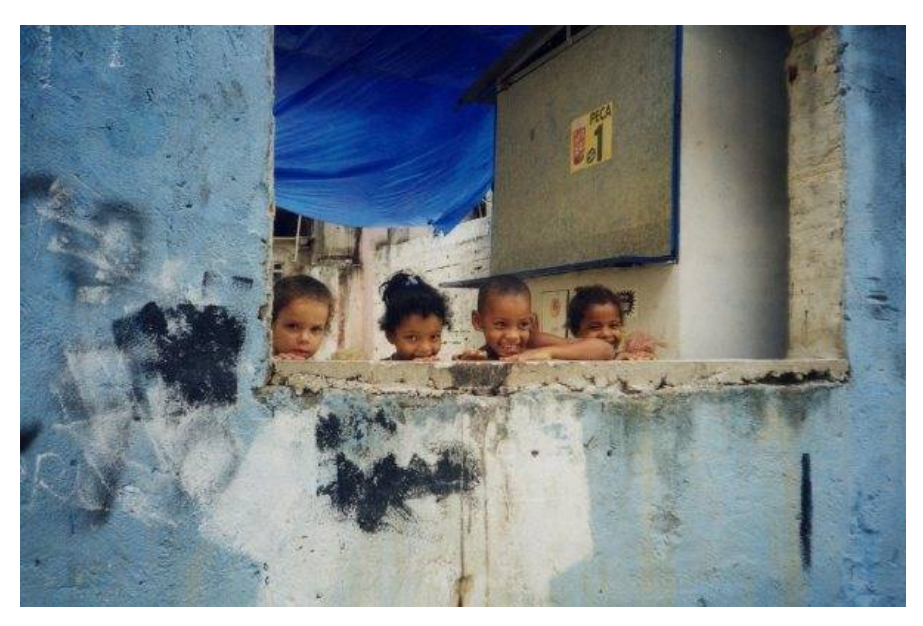
Photo: The children I met in Favela (means slum in Portuguese) in Rio de Janeiro in 1998. I hope they have been able to keep on smiling like in this picture, even after more than 10 years

Next month, I will be going to Brazil for the first time in more than 10 years. I also want the Brazilians to know about Popoki and it may be a small step toward correcting the gap.