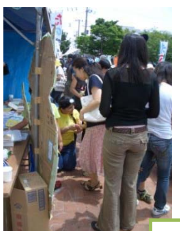
the festival an opportunity to think about peace. The children write messages for peace