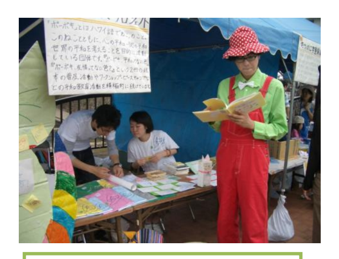
The Popoki Peace Project booth.