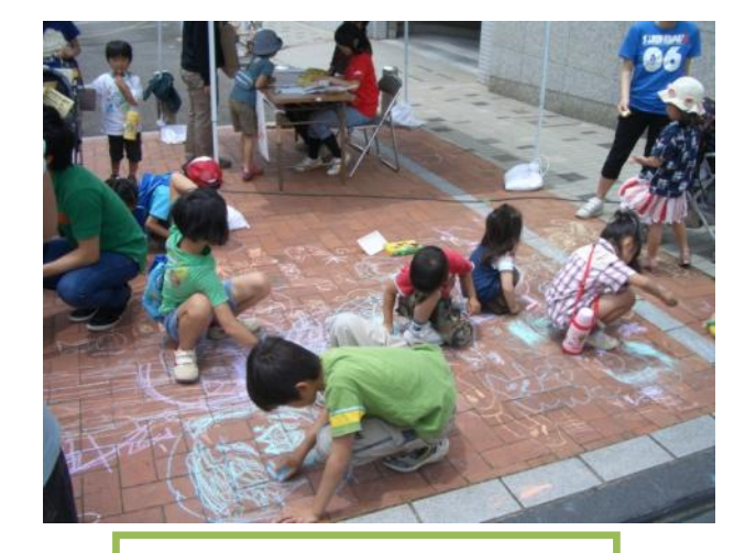
Above: Drawing with chalk

peace. We also gave a stage performance of Popoki. The reason for our participation was that we want to give people attending the festival an opportunity to think about peace.