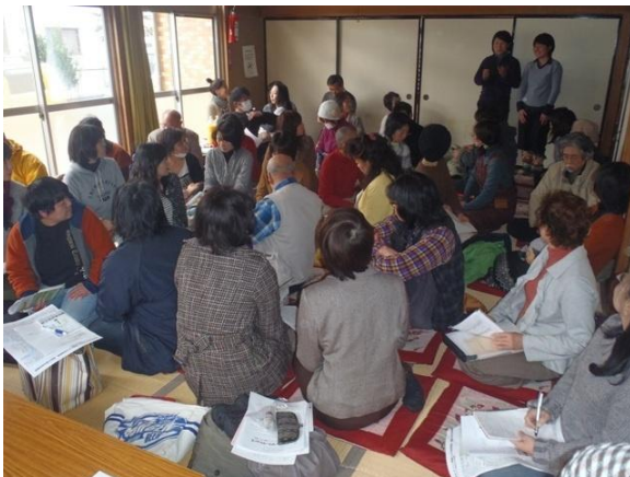
A mother's group who are involved in organic farming has a workshop. Ookawa town in Miyagi