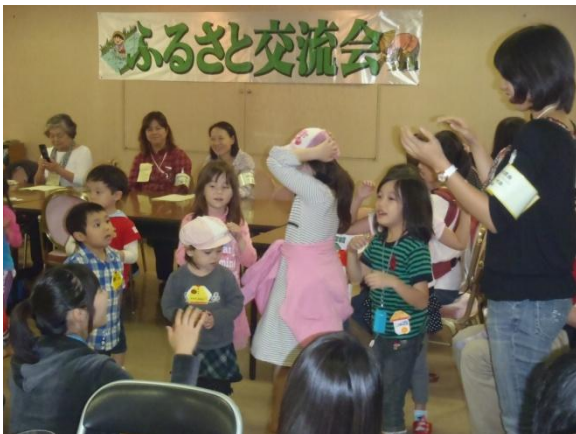
Dance with Kids. They move from "Hisaichi" to Aichi. Lovely music, Marumaru Morimori!