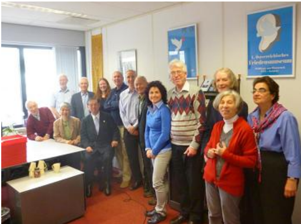
The INMP board members in The Hague, Netherlands

I am sure that many people in Fukushima and other places were encouraged to write their messages and illustrations. The big cloth has many stories of various people in the world and it is a precious record for peace and friendship. I hope that the cloth will be exhibited at peace museums in various countries. There is the International Network of Museums for Peace (INMP): http://www.museumsforpeace.org . I also hope that many people will read this inspiring book.